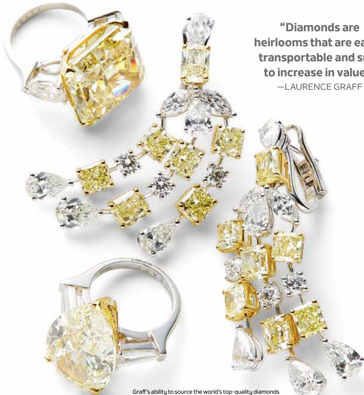
Graff's ability to source the world's top-quality diamonds is illustrated by this radiant-cut fancy intense-yellow diamond ring, fancy yellow diamond ring, and white-and-yellow diamond earrings (graffdiamonds.com).