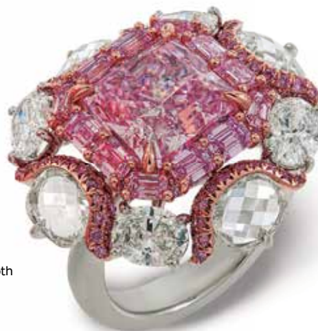
An especially rare 3.13-carat fancy vivid-blue internally flawless diamond ring and a bracelet with five fancy intense-pink diamonds, both part of the ScienS Coloured Diamond Fund at Asprey ( asprey.com ); Nirav Modi’s 4.63-carat fancy intense-purplish-pink diamond ring ( niravmodi.com ).