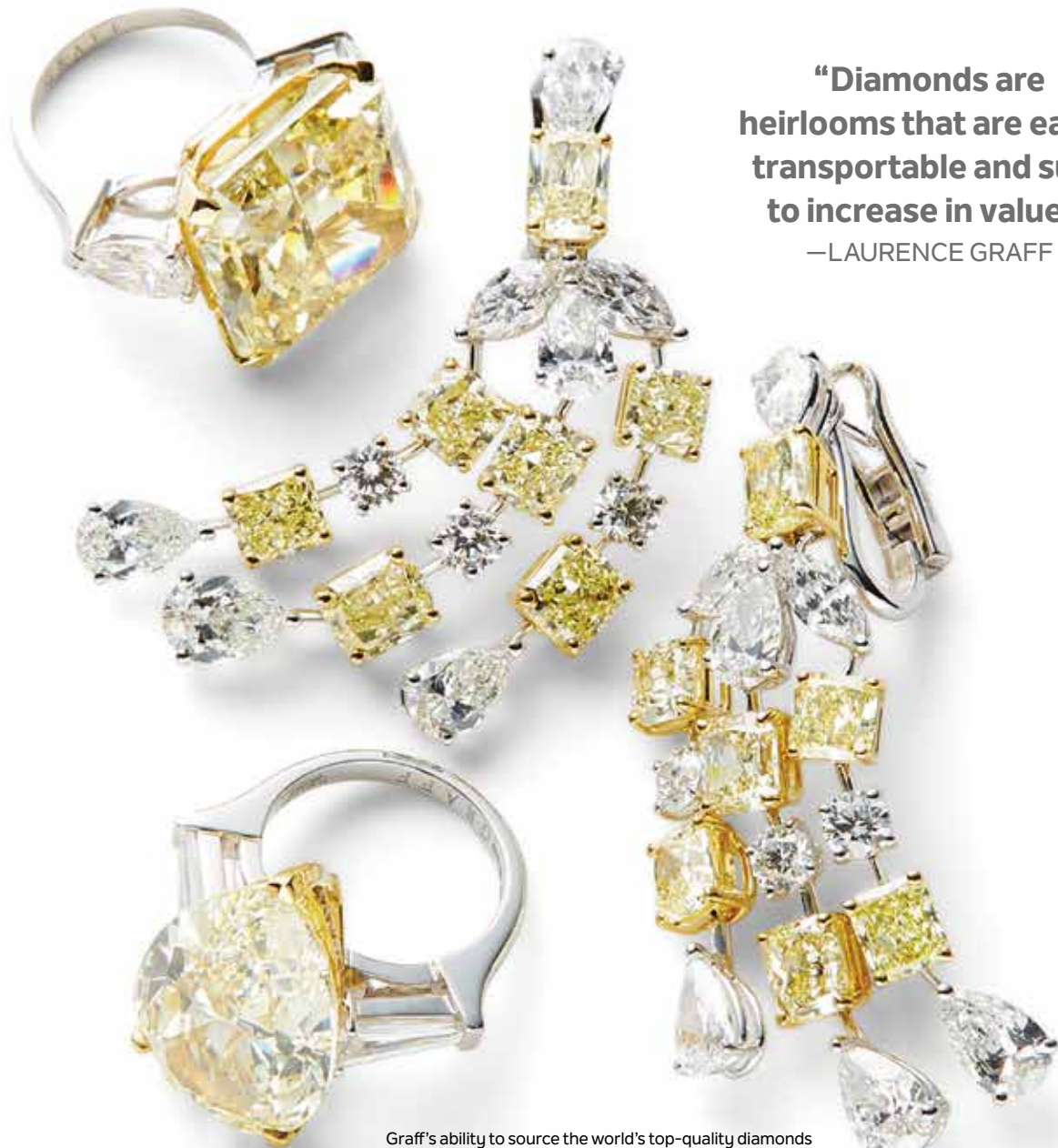
Graff's ability to source the world's top-quality diamonds is illustrated by this radiant-cut fancy intense-yellow diamond ring, fancy yellow diamond ring, and white-and-yellow diamond earrings (graffdiamonds.com).